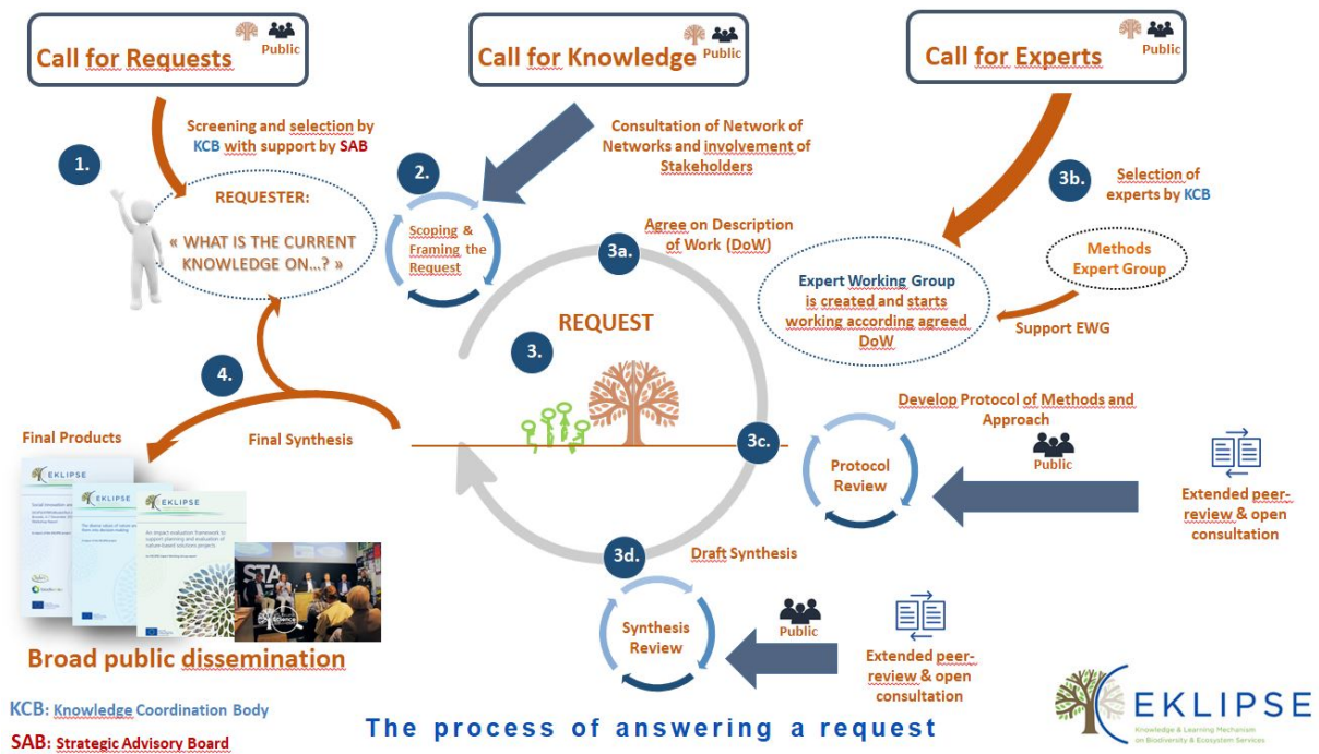
Figure 2: The EKLIPSE process of answering a request